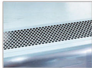
Anti-paper dust structure