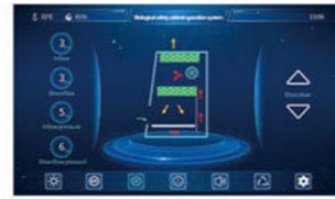
LCD Display 7 inch large touch screen is easy to monitor all the safety parameters at a glance and ergonomically sized control panel