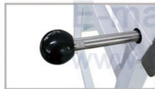
Handle Four handles on each corner, easier to move the unit to anywhere